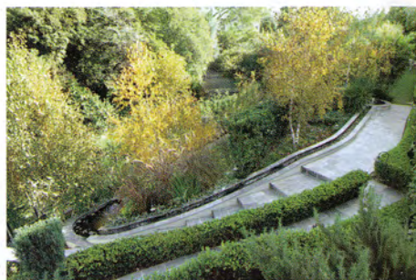
ABOVE: White-trunk birch trees, gnarled olive trees and a dense Eugenia hedge provide privacy.

Before the renovation, the street entrance was exposed to public view. Swaths of agapanthus and several overgrown eucalyptus trees were the main garden elements. Now, a multitude of 'Climbing Iceberg' roses soften the walls and fences enclosing the manor. Visitors enter by stone steps clad in Bouquet Canyon stone and edged on one side by a water rill spilling out of a circular fountain on an upper level. Baer added it to create a border for a new swath of green lawn and to camouflage street noises with the sound of cascading water. Eucalyptus trees were removed because their roots were endangering the house foundation. In their place is a forest of white-trunk birch trees, gnarled olive trees, and a dense eugenia hedge. Red fountain grass adds movement and texture and lavender perfumes the air. Near the house entrance is a long border edged with boxwood and containing espaliered Meyer lemon trees.